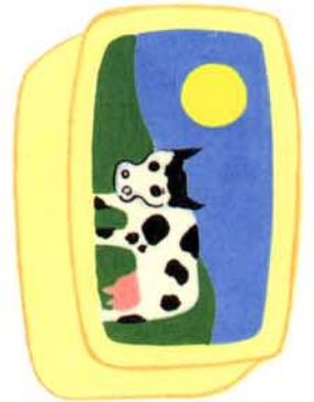
low fat spread